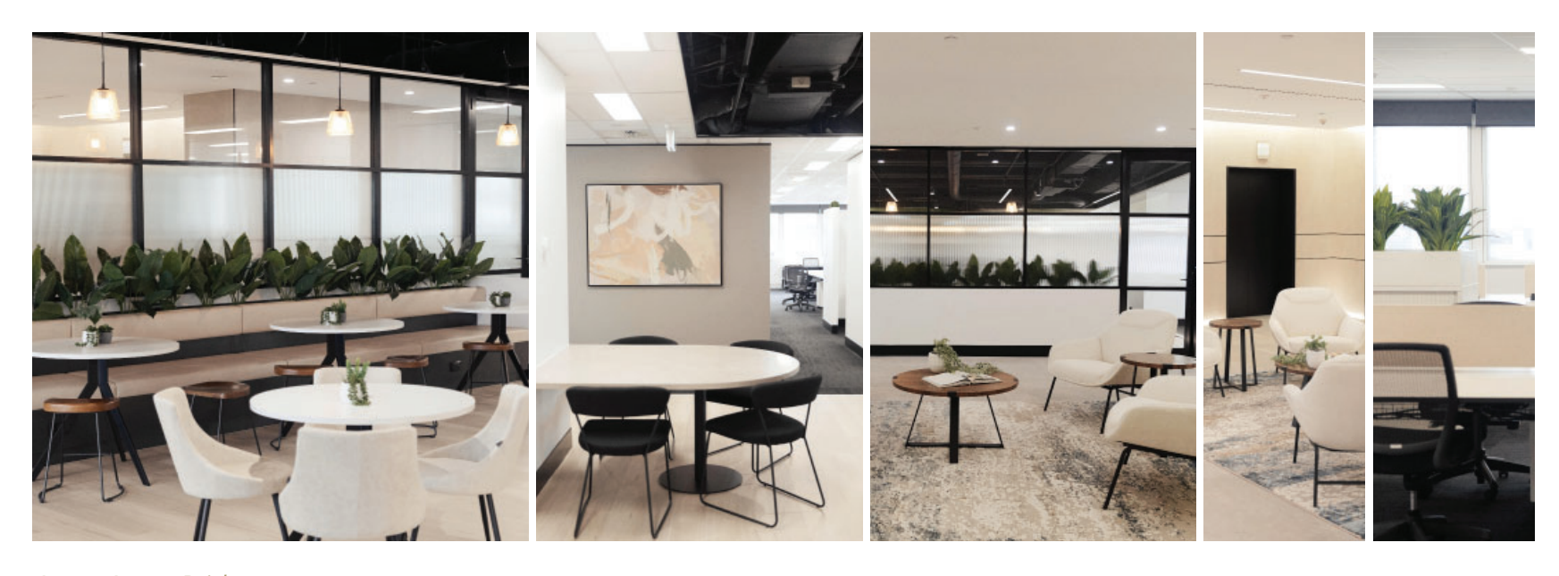
Queen Street, Brisbane