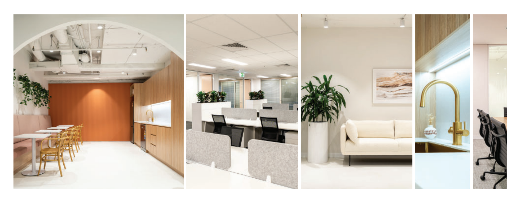
Castlereagh Street, Sydney