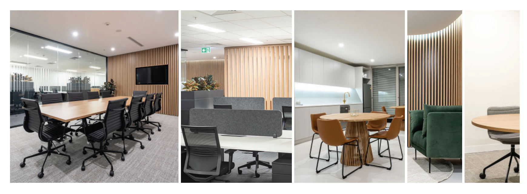
Castlereagh Street, Sydney