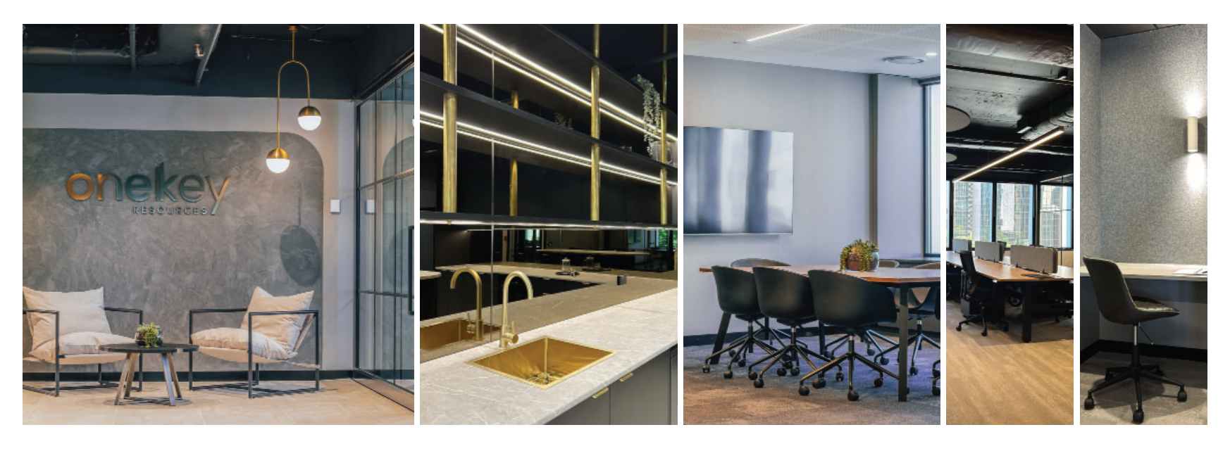
Edward Street, Brisbane